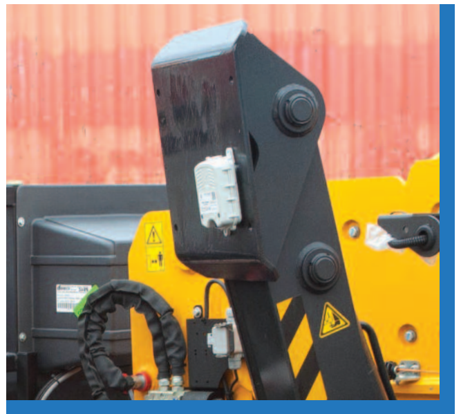
Different usage purposes